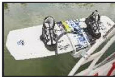
FIXED BOARD RACKS OPT: ALL MODELS *REQUIRES ARCH TOWER