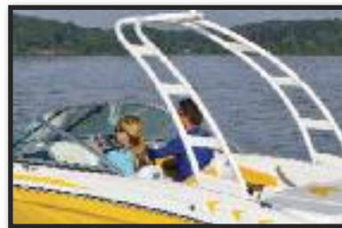
VELOCITY FOLDING ARCH TOWER WHITE OR BLACK POWDERCOAT OPT: ALL MODELS