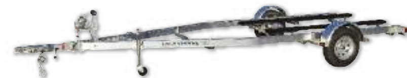
SPARE TIRE KIT OPT: ALL MODELS BRAKE UPGRADE FOR STANDARD POWDER COATED TRAILER STD: 19SF • 19S • 21SF • 21S OPT: 18SF • 18S