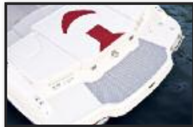
HYDRO TURF SWIM PLATFORM MAT OPT: ALL MODELS

INCLUDES: CONVENIENCE PACKAGE, SNAP-IN CARPET, ULTRA-COMFORT PEDESTAL SEAT W/FLIP-UP BOLSTER FOR HELM AND PASSENGER, PORT CONSOLE STORAGE DOOR, AIR PUMP, MOORING COVER, BIMINI TOP OR TOWER TOP CANVAS, DELUXE BADGING OPT: ALL MODELS