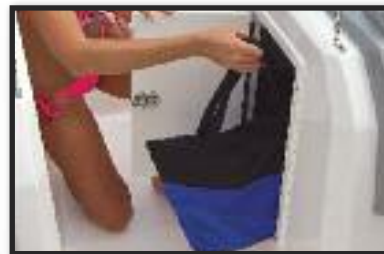
STARBOARD CONSOLE STORAGE STD: 19SF • 19S • 21SF • 21S OPT: 18SF • 18S