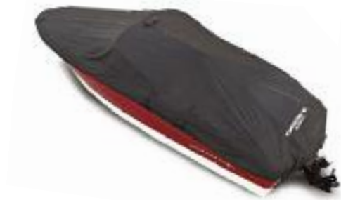
MOORING COVER OPT: ALL MODELS