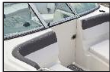
BOW WALK-THRU DOOR OPT: 21SF • 21S