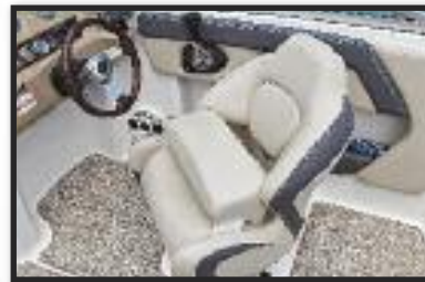
ULTRA COMFORT PEDESTAL SEAT WITH FLIP-UP FRONT CUSHION OPT (1) OR (2): ALL MODELS