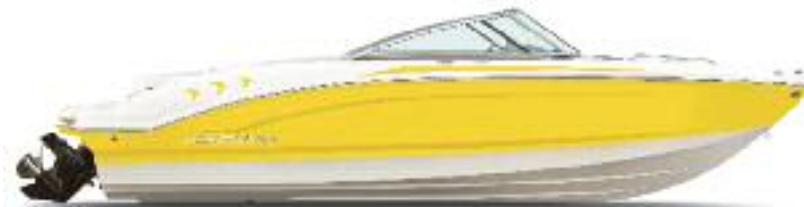
WIDE BAND STANDARD FIRE RED, BISCAYNE BLUE, STEALTH GRAY, BLACK OR YELLOW STD: ALL MODELS