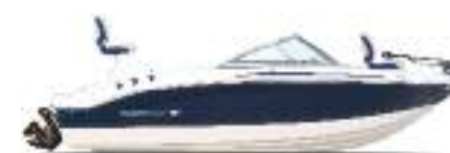
18 SKI & FISH