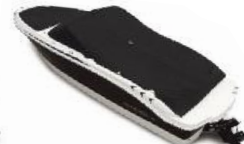
COCKPIT AND BOW COVER OPT: ALL MODELS