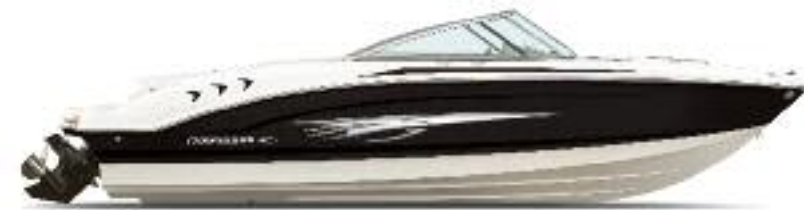
WIDE BAND SKI & FISH CHROME GRAPHIC FIRE RED, BISCAYNE BLUE, STEALTH GRAY, BLACK OR YELLOW OPT: 18 / 19 / 21 SKI & FISH