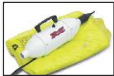
AIR PUMP OPT: ALL MODELS