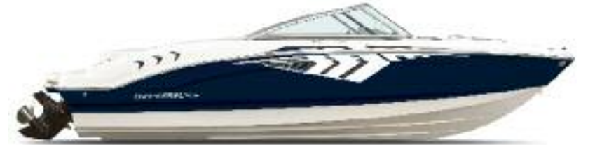
WIDE BAND WITH VELOCITY GRAPHIC FIRE RED, BISCAYNE BLUE, STEALTH GRAY, BLACK OR YELLOW OPT: ALL MODELS