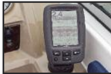
GARMIN FISH FINDER OPT: 18SF • 19SF • 21SF