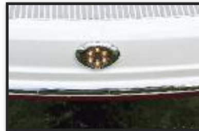
MOVING PROP ALERT SYSTEM OPT: ALL MODELS