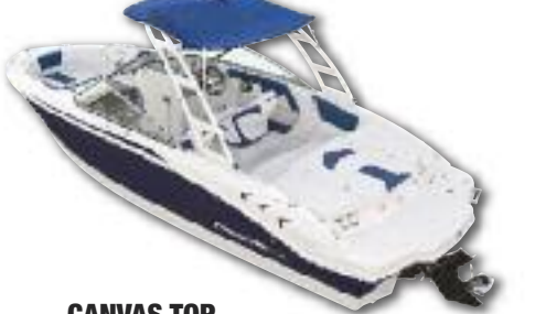
CANVAS TOP FOLDING ARCH TOWER OPT: ALL MODELS