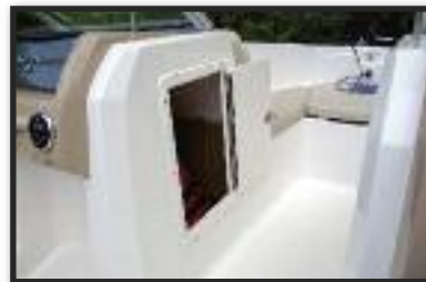
PORT CONSOLE STORAGE STD: 21SF OPT: 18SF • 18S • 19SF • 19S • 21S