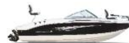
19 SKI & FISH