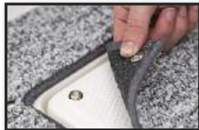
SNAP-IN CARPET OPT: ALL MODELS