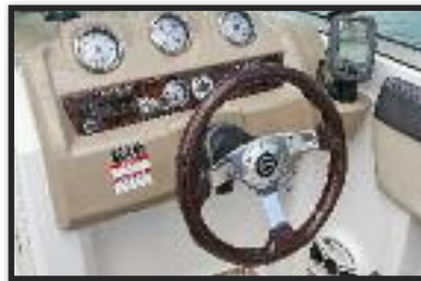
WOODGRAIN DASH PANEL AND STEERING WHEEL OPT: ALL MODELS