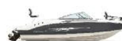
21 SKI & FISH