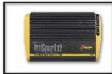
BATTERY CHARGER DUAL OPT: 18SF • 19SF TRIPLE OPT: 21 SF