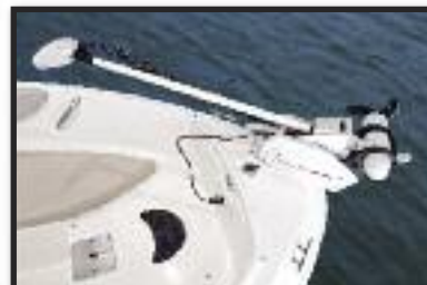
SALTWATER TROLLING MOTOR UPGRADE OPT: 18SF • 19SF • 21SF