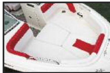
BOW FILLER CUSHION OPT: 21S