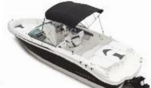
BIMINI TOP WITH BOOT OPT: ALL MODELS