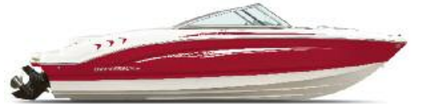
WIDE BAND WITH SPLASH GRAPHIC FIRE RED, BISCAYNE BLUE, STEALTH GRAY, BLACK OR YELLOW OPT: 18 / 19 / 21 SPORT